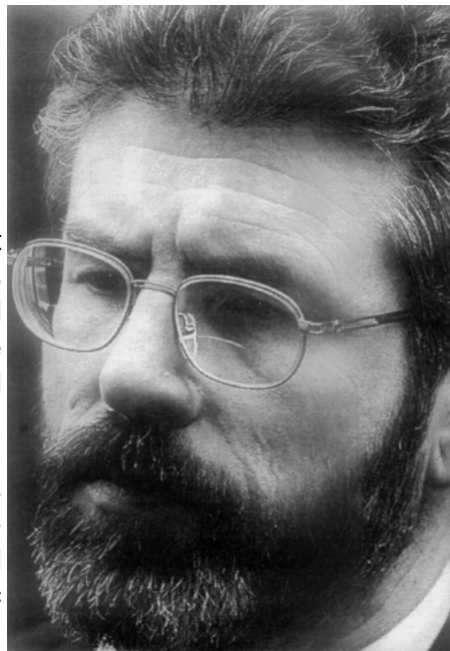
GERRY ADAMS: Marxist spokesman for Sinn Fein/IRA MURDERERS

Their genocidal terrorist war against the White British people of Northern Ireland demonstrates their true Marxist agenda. Don't be duped! Don't buy their phoney 'Irish Unity' propaganda hype. Next time they call collecting for funds just say "NO!" Tell these commies no money for IRA death squads!