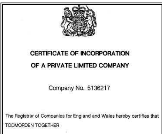
Above: Todmorden Together's 'Company Registration Documents', which we read with great interest..

THE BPP WILL BE KEEPING A VERY CLOSE EYE UPON THIS GROUP AND THEIR FRIENDS IN OTHER GROUPS - WE WILL KEEP YOU POSTED!